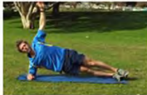
Side Bridge Leg Abductions