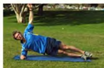
Side Bridge Leg Abductions