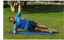
Side Bridge Leg Abductions