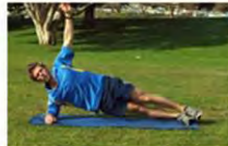
Side Bridge Leg Abductions