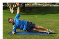
Side Bridge Leg Abductions