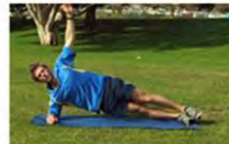
Side Bridge Leg Abductions